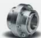
O Falk Lifelign® Gear Couplings