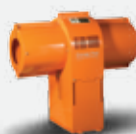
P Falk Orange Peel® Rotating Shaft Guards