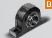
B Rexnord SHURLOK® Adapter Mount Spherical Roller Bearings