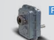
F Falk® Quadrive® Shaft-Mounted Gear Drives