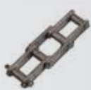
U Link-Belt & Rex Engineered Steel Chain