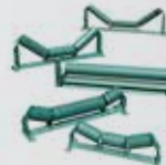
V Rex Conveyor Idlers